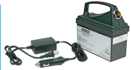
Geopump™ Modular Battery and Charger