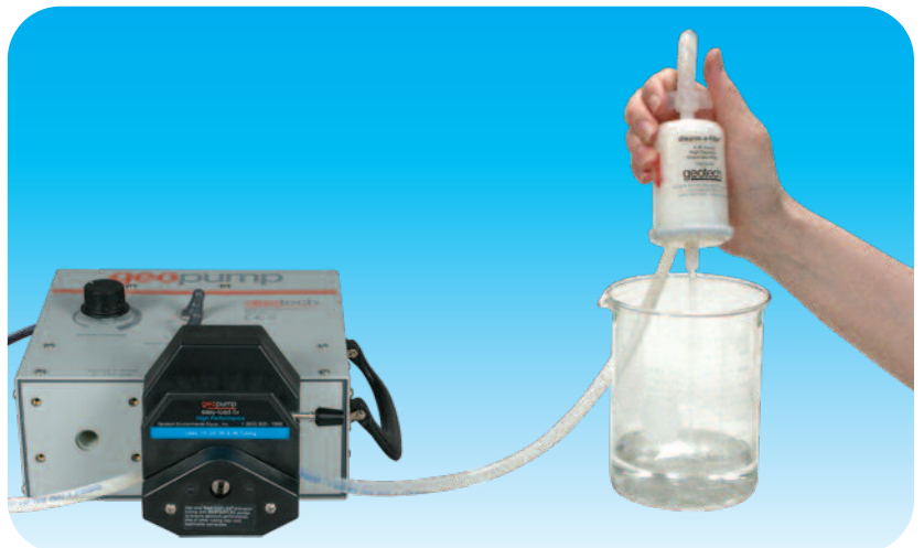
Sample collection with the Geopump™ Peristaltic Pump Series II with optional easy-load II® pump head (dispos-a-filter™ capsule sold separately)