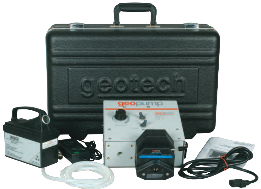
Geopump™ Peristaltic Pump Series II Kit with optional easy-load II® pump head, modular battery, 5 ft. (1.5 m) tubing, carrying case and power cord