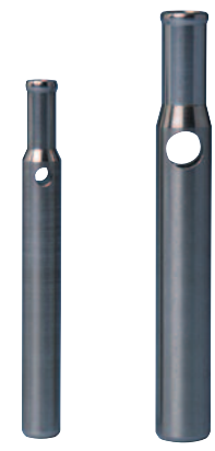
Geopump™ Tubing Weights